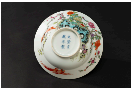
049 A FAMILLE-ROSE 'FLOWERS' BOWL 20TH CENTURY 二十世纪 粉彩折枝花卉纹盘