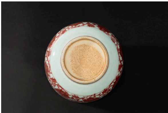
051 AN UNDERGLAZE-RED 'FLORAL SCROLL' BOWL MING DYNASTY, 14TH - 15TH CENTURY 明代 釉里红缠枝花卉纹大盂