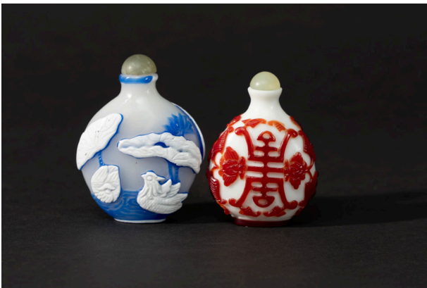
072 TWO OVERLAY GLASS SNUFF BOTTLES 18TH - 19TH CENTURY 十八至十九世纪 套料雕花鸟纹鼻烟壶两件