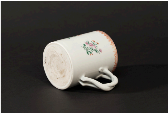
044 A FAMILLE-ROSE 'FLORAL' EXPORT MUG QING DYNASTY, QIANLONG PERIOD 清乾隆 粉彩花卉纹马克杯 (外销瓷)