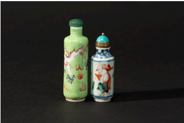
074 TWO PORCELAIN SNUFF BOTTLES 19TH CENTURY 十九世纪 瓷制鼻烟壶两件