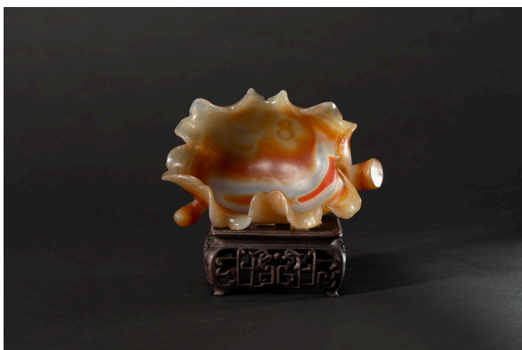
091 A CARVED AGATE 'LOTUS LEAF' CUP 20TH CENTURY 二十世纪 玛瑙雕荷叶式杯