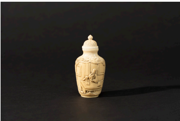
084 A MAGNIFICENT AND RARE CARVED IVORY 'LITERATI' SNUFF BOTTLE QING DYNASTY, 19TH CENTURY 清十九世纪象牙高浮雕“高士图”大号鼻烟壶